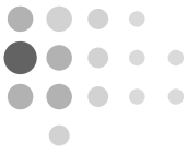
Figure 1: Overlapping Security Structures in Western Africa