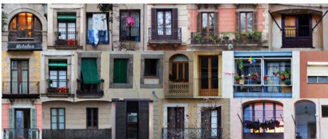
A collage of several different streets in Barcelona

People without homes and homes without people—this paradox is a major issue in many European cities, exacerbating the housing affordability crisis. However, the Basque Government (Basque Autonomous Region, Spain) has taken a proactive approach by repurposing empty homes for social rental housing. The Bizigune Program, in place since 2003, offers a win-win solution: providing hassle-free leases for owners of vacant properties while ensuring affordable rents for tenants in need. Managed by the Basque public rental housing agency, Alokabide, as of 2025 the program oversees nearly 7,400 housing units, which accounts for more than 5% of the rental housing stock in the region, effectively increasing the supply of social rental housing.