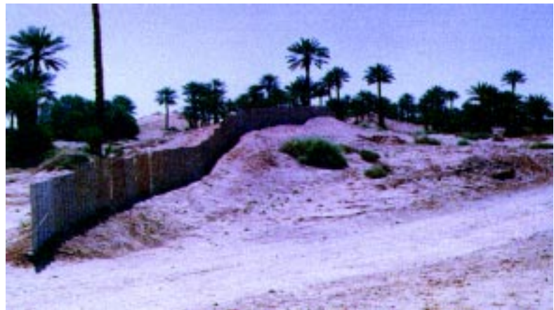
Barrier to fight desertification

On an ecological level, the oases are threatened by two essential problems, namely salinity and sanding-up. In addition to the rigorous climate, these forms of degradation are exacerbated by excessive irrigation and the excessive removal of spontaneously growing vegetation on the periphery of the palm groves which in turn inevitably promotes sanding-up. The latter poses a permanent threat to dwellings, arable land, the irrigation canals, and the road infrastructure of the palm groves.