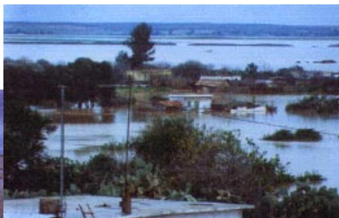
Flooded dwellings in the Gharb