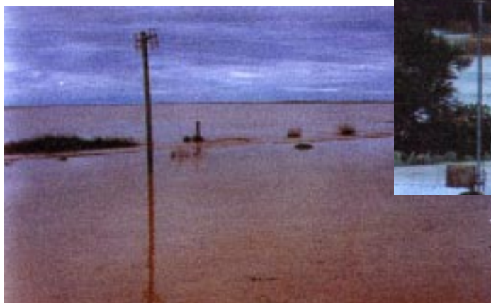
Damages caused to harvests during the 1996 floods