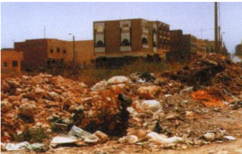
An insalubrious scene in a residential quarter

According to the 1989 census conducted by the Ministry of Housing, 23% of the urban population is living in shanty towns and inappropriate housing built without permits on non-developed land.