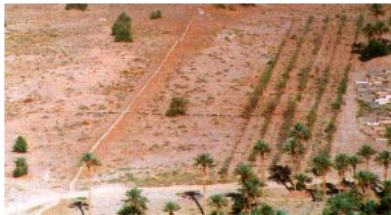
Illustration of the poverty of the vegetation surrounding the palm