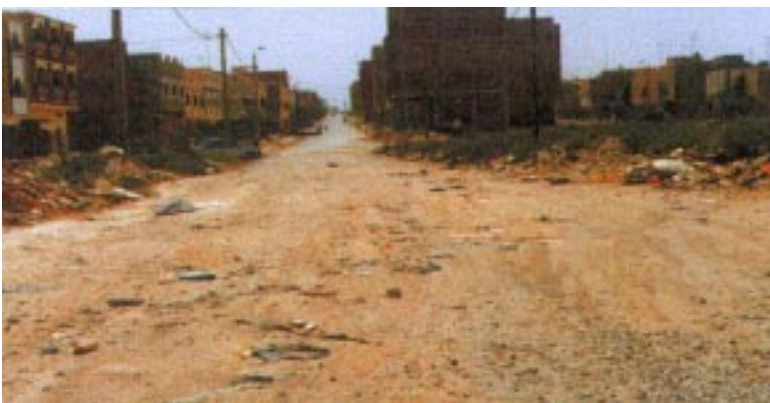
An anarchic urbanization scene as can often be seen in Rabat-salé