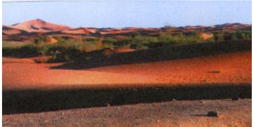
Panoramic view of an oasis in Tafilalet that is threatened by sanding-up.

Salinization is a form of degradation i.e. desertification of irrigated lands. The loss of land due to salinization has not been evaluated but the phenomenon is continually increasing and is recognizable in the form of a modified structure of the affected soil, the decrease in its cohesion and productivity, as well as its alkalization which causes its sterilization and hence desertification. Fragmented studies estimate that 37 000 hectares of irrigated lands are already severely affected by salinization and that 500 000 hectares are threatened by too much water as well as salinity.